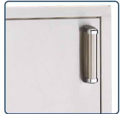
Heavy duty handles to complement FireMagic® grills.