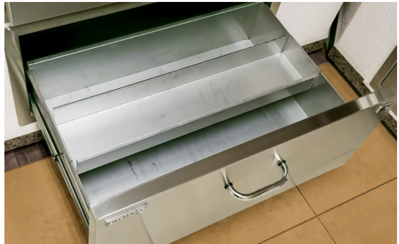
Large Utility Bin