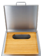
Cut & Clean Combo 53816 (sold separately)