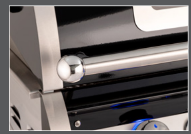
Black Porcelain Coated Finish with Satin Stainless Steel Accents