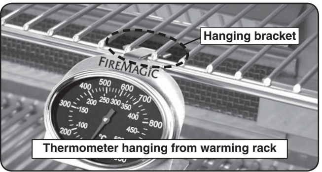
Thermometer hanging from warming rack