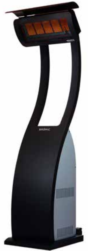
Tungsten Smart-Heat™ Portable

With a high degree of maneuverability and adjustable heating, the Tungsten Smart-Heat™ Portable is one of the most versatile and user friendly portable heaters available.