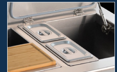
Removable Condiment Trays