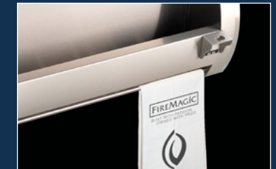
Towel Rack & Bottle Opener