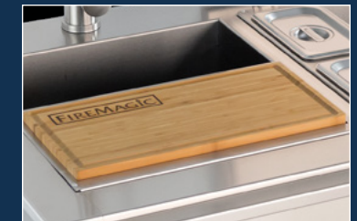
Removable Bamboo Cutting Board